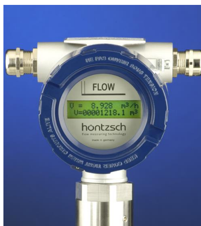
Ex-d transducer housing with optional LCD display